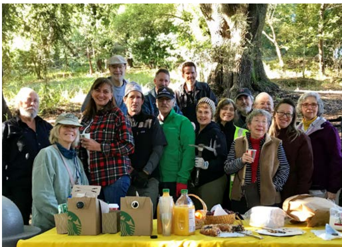
Gerstle Park Redwood Grove, Dec 2, 2018