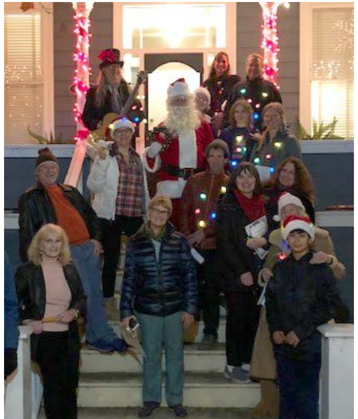
Santa and the Caroling crew