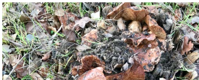
Mushrooms found on Gerstle Park trails

Please contact info@gerstlepark.com if you can ID the mushroom species, and if you'd like to join me on a hillside some day this winter.