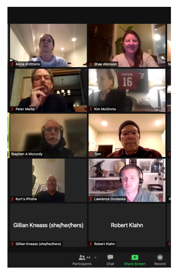
Our 2022 Annual (Zoom!) Meeting

The GPNA is a 100% volunteer commitment, and