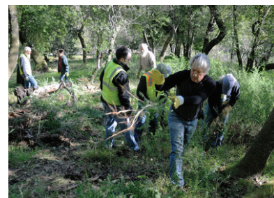
Volunteers pulled French broom from a hillside taking part in National Day of Service.

We suggest you take a walk along the fire road that leads to D Street. You will see a huge change, if you haven't been there for awhile. Volunteers work daily to extend these cleared areas and you are welcome you to join us. Fresh air, accomplishment and exercise are the results. Much better than being on a treadmill! Our removal season usually ends about May 1 depending on weather. Once it gets warm, the earth dries and makes removal difficult. Our open space project is now in about the 20th year. When we first started, nobody realized that we had an open space area. You couldn't have even hiked it if you tried. Now the area has become a neighborhood asset and is used daily by hikers and dog walkers.